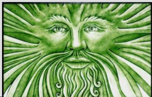
Green Man ~ Beltane Blessings

Sunday, May 26th - TBA This was originally meant to be an R.E. Sunday and intergenerational service, but with recent changes to our R.E. leadership... watch your Friday email.