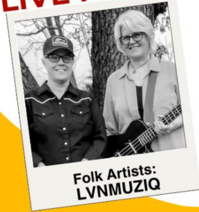
Folk Artists: LVNMUZIQ